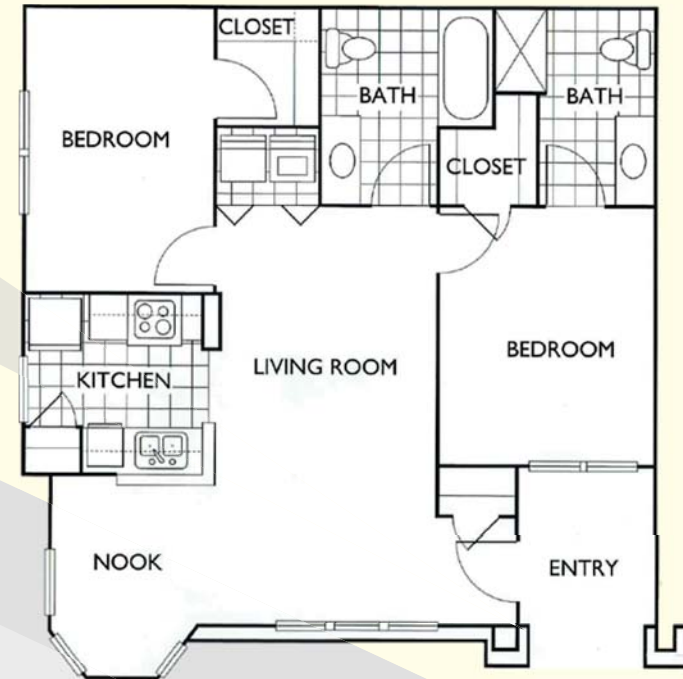
Two Bedroom / Two Bath 1,039 Sq. Ft.*